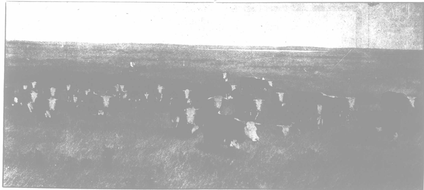
Hereford Cattle, Crane Lake, Assinibola, Main Line Canadian Pacific Railway.

The Canadian Pacific Railway Company have 14,000,000 acres of choice farming lands for sale in Manitoba, Assiniboia, Saskatchewan and Alberta. Manitoba lands and Assiniboia lands east of third meridian, $4 to $10 per acre. Lands west of third meridian, $3.50 to $7 per acre.