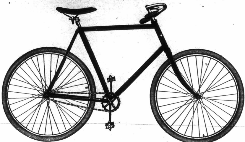
THE HYSLOP REGENT NO. 1. (Designed for road use.)

Manufactured by HYSLOP, SON & MCBURNEY, Toronto.