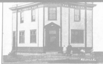
Dominion Bank of Canada - One of Melville's Three Banks

As far out as Ninth avenue lots which originally sold at $75 to $100 a lot, are now being sold as high as $500 a lot. The site of the Municipal Rink was purchased originally for $225, and a year ago was sold to the city for $1,250. Two other lots sold originally at $100 and