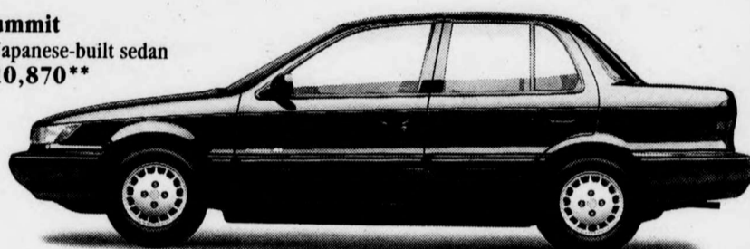
Eagle Summit A sporty Japanese-built sedan From $10,870**