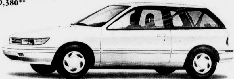
Plymouth Colt 200 A high-spirited car with style From $9,380**

You've worked hard for your education. And now Chrysler wants to start you on your way with incredible savings on your first new car or truck.