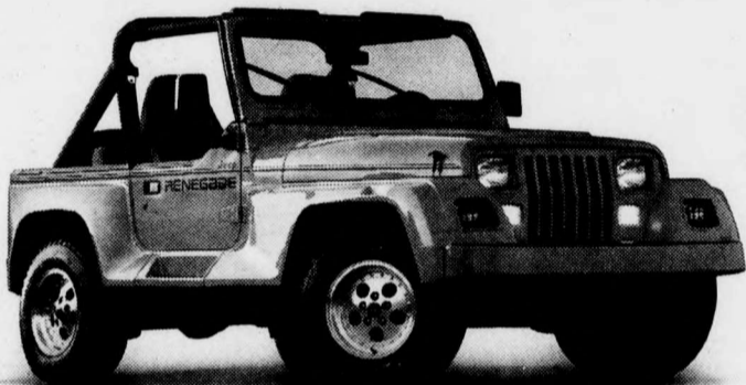
Jeep YJ The fun-to-drive convertible From $12,165**