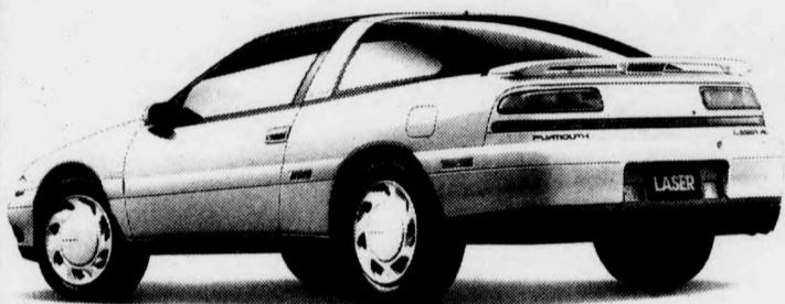
Plymouth Laser Sizzling looks and hot performance From $13,735**

in addition to any other incentives PLUS NO PAYMENTS FOR 3 MONTHS on selected offers†