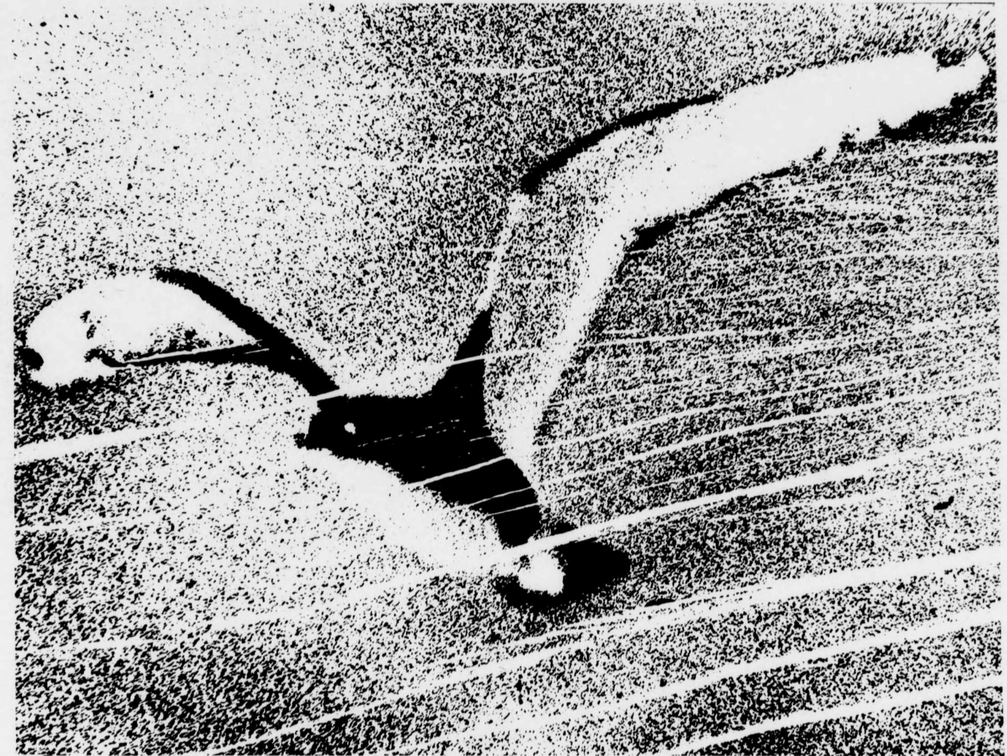
Honorable mention A.S. Lamb