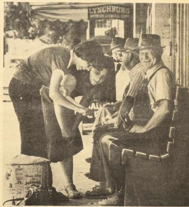
Jack Daniel's Tennessee Whiskey is represented in Canada by FBM Distillery Ltd., Brampton, Ontario

LYNCHBURG, TENNESSEE (population 361) is where we make Jack Daniel's Tennessee Whiskey, and where we make lots of Canadian friends.