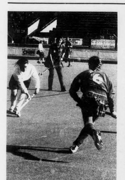
V-Reds attack on offence

The Reds next home game will be Wednesday, November 15 at 7:30pm as they take on the Mt. A Mounties. This will be the Reds final home game for this half of the season.