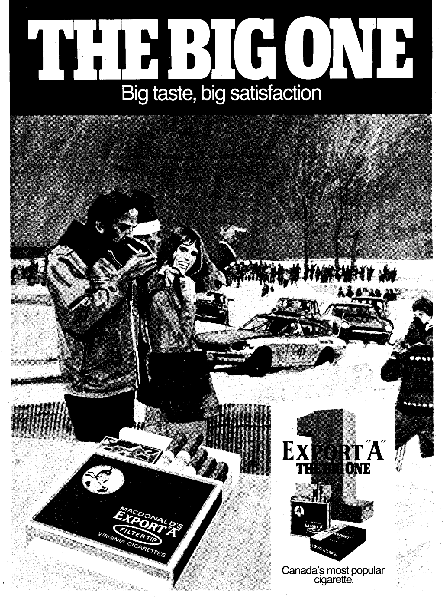
Warning: The Department of National Health and Welfare advises that danger to health increases with amount smoked