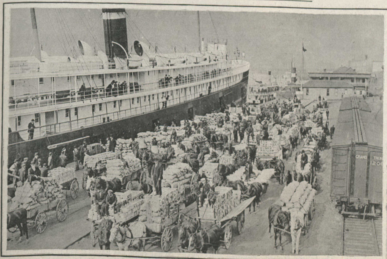
A hundred tons of small Southern Canada Fruit being loaded on one of the Vessels of the Northern Navigation Company, at Sarnia, for shipment West.

S HIPPING fruit in Canada is one of the problems in handling and cold storage. A few weeks ago a first shipment of Niagara peaches was sent to England. The experiment was successful, though the fruit had been picked rather too green. For some time now small fruits have been sent by express from Oakville, Ont., and points beyond to Winnipeg which is nearer the Ontario fruit belts than to the fruit areas of British Columbia.