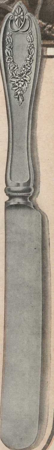
Old Colony Knife