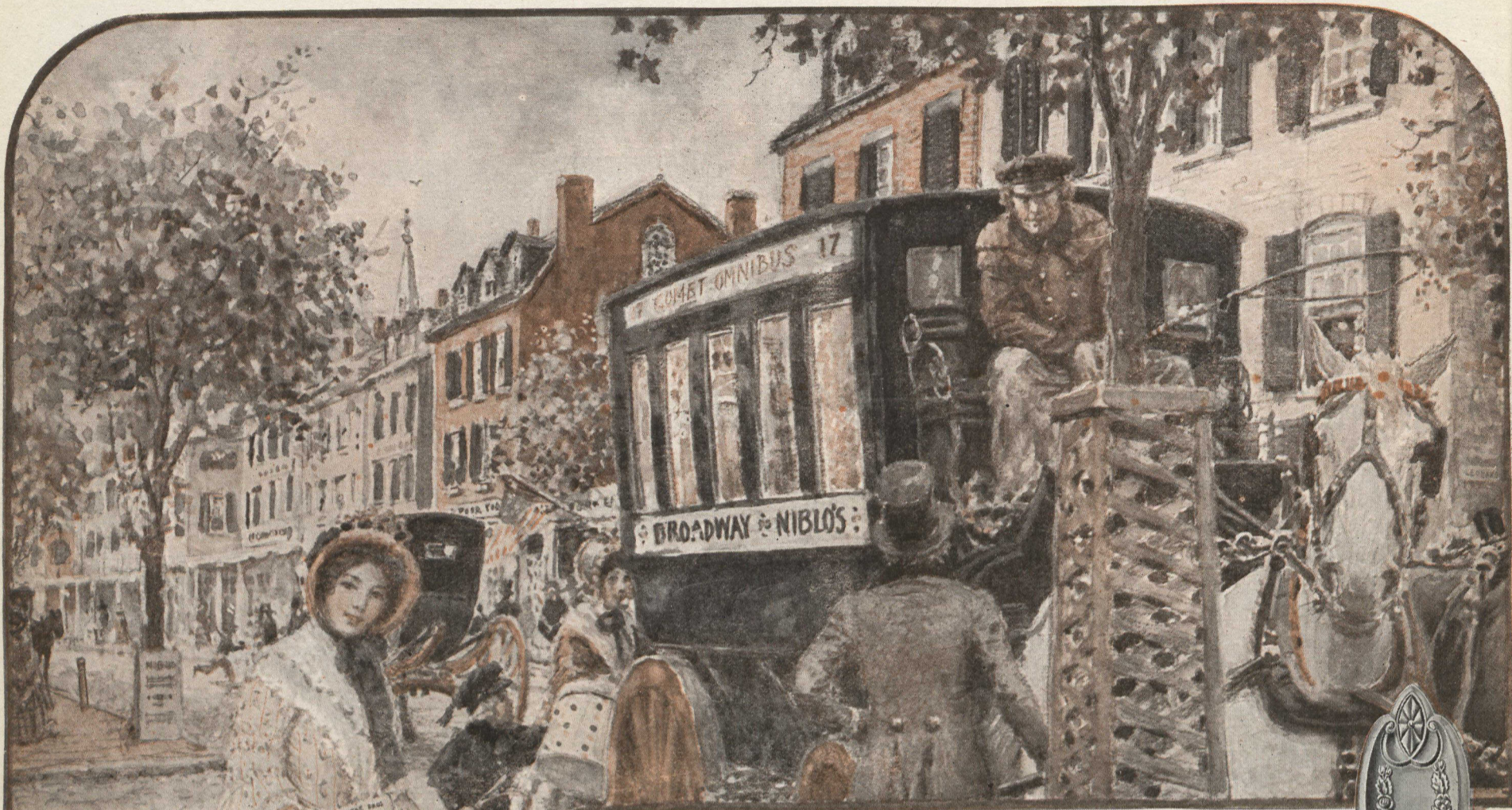
Broadway, at Leonard Street, New York City, 1847.

A bit of realism is portrayed in the picture which is true to life as it was on Broadway in 1847. Then it was that the silver spoons, forks and knives produced by Rogers Brothers and destined to become celebrated as