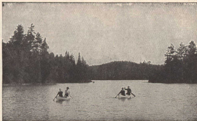
On the Montreal River, Temagami.

Black bass, speckled trout, lake trout, wall-eyed pike in abundance. Moose, deer, bear, partridges and other game during hunting season.