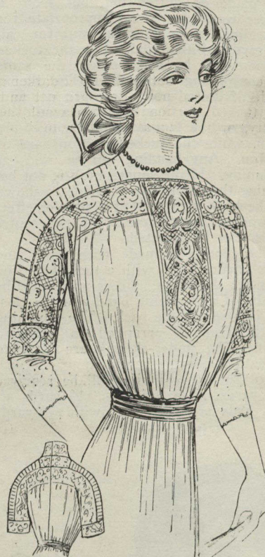
Fancy Blouse Pattern No. 7186

THE peasant blouse in its many variations continues to be a favorite. This model is novel, the yoke being cut in points. It can be finished with or without a collar, and with or