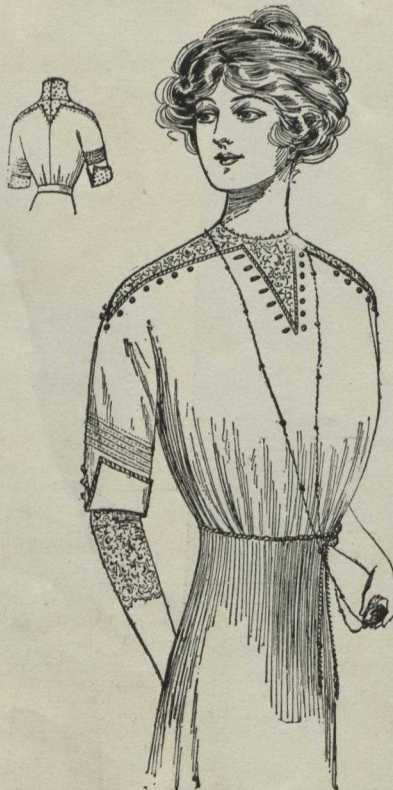
Peasant Blouse Pattern No. 7122

For a woman of medium size will be required 2\frac{1}{4} yards of material 27,