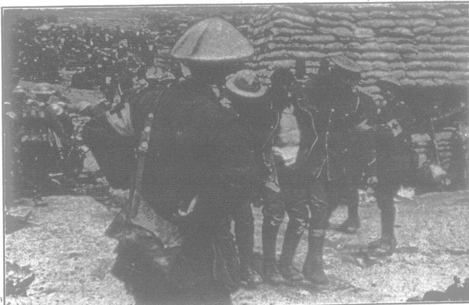
Wounded in the Trenches—Official Film, "Battle of the Somme."