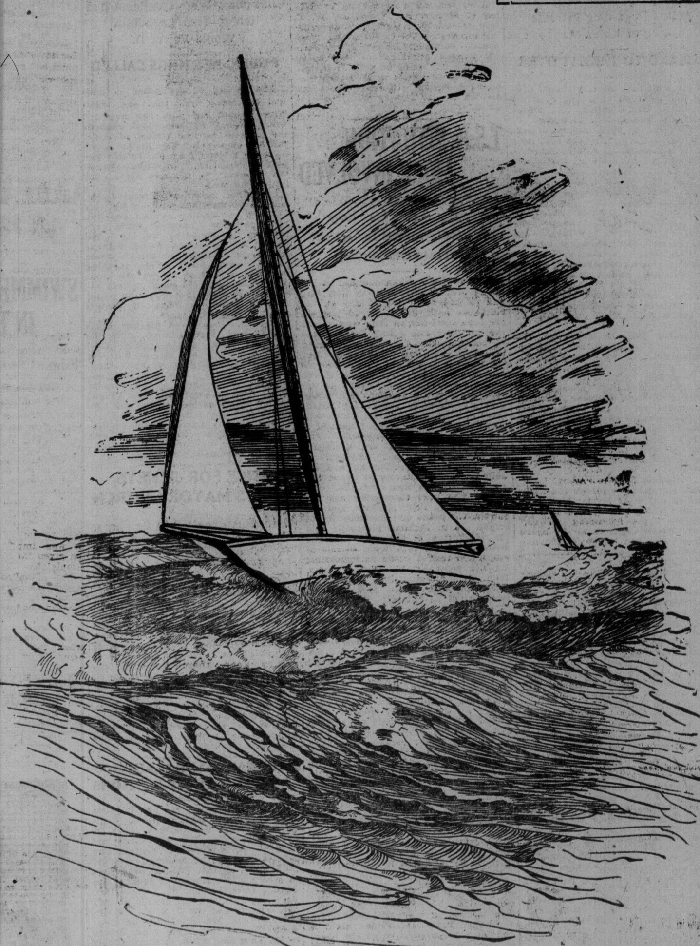
WITH the big race in preparation every boy who loves the water will be thinking of his "Shamrock," his "Vanitie" or "Resolute."

IT MAY be of interest to know that $75.00 is not the usual price of this boat, but a very special one.