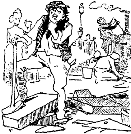
IT'S NONSENSE, THAT'S ALL.

"LET'S see: they tell us that Labor depends upon Capital, and yet Labor was in this country a long time before Capital arrived. I don't see through it!"