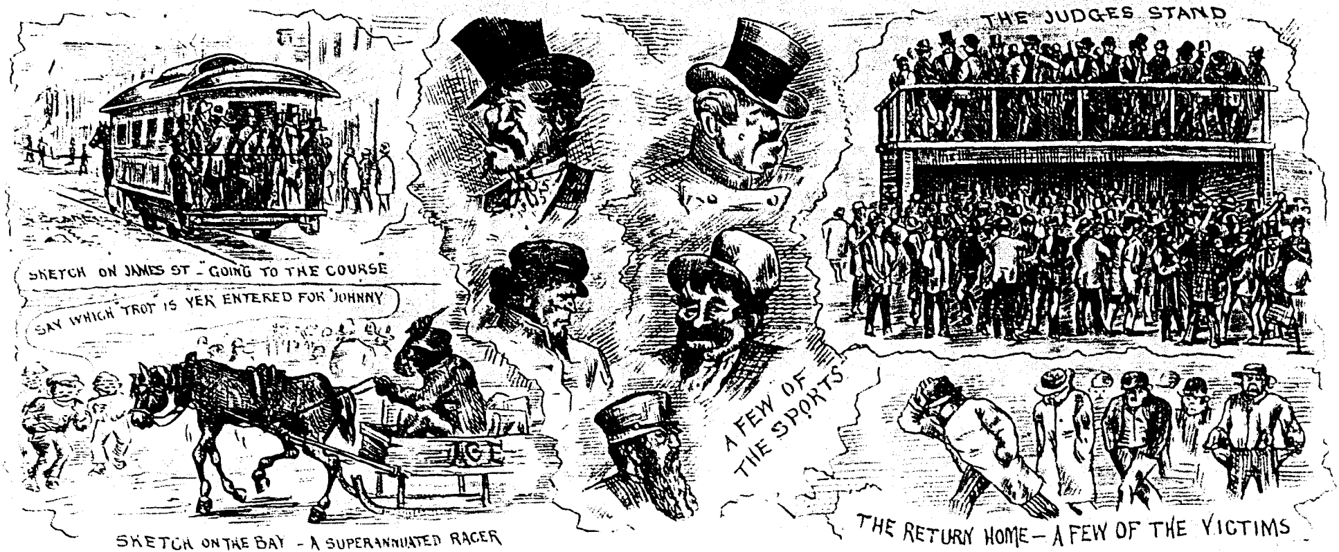
HAMILTON: JOTTINGS AT THE RACES ON BURLINGTON BAY