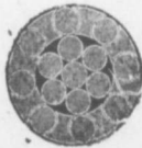
Locked Coil Aerial Cable or Colliery Guide.