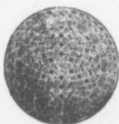
Locked Coil Winding Cable.

Manufacturers of all Kinds of WIRE ROPES for Mines, Tramways, Aerial Ropeways, Suspension Bridges, Cranes, Elevators, Transmission of Power, Steam Ploughing and General Engineering Purposes.