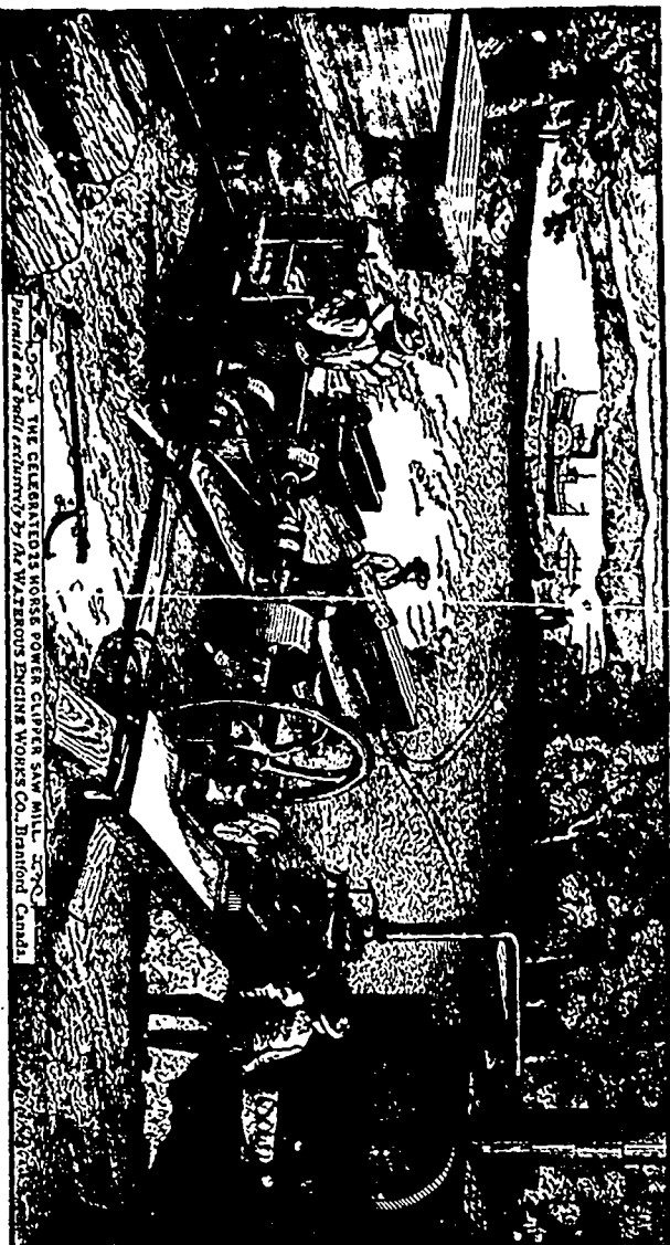
THIS IS THE CELEBRATED HORSE POWER SAW MILL, 30 H.P. PATENT DIRECT ACTION MILL, MANUFACTURED BY WALTERS & BRANTFORD, BRANTFORD, CANADA.

Above cut represents our 25 H. P. Patent Direct Action Mill which we guarantee to cut 8,000 to 12,000 feet of lumber per day of ten hours, and to be the most efficient, economical and durable mill built in America, and will saw lumber of cheaper per thousand than heavy large size belted or gang mills. For over a quarter of a century the leading pioneer mill of Canadian settlers. Especially constructed for hard work.