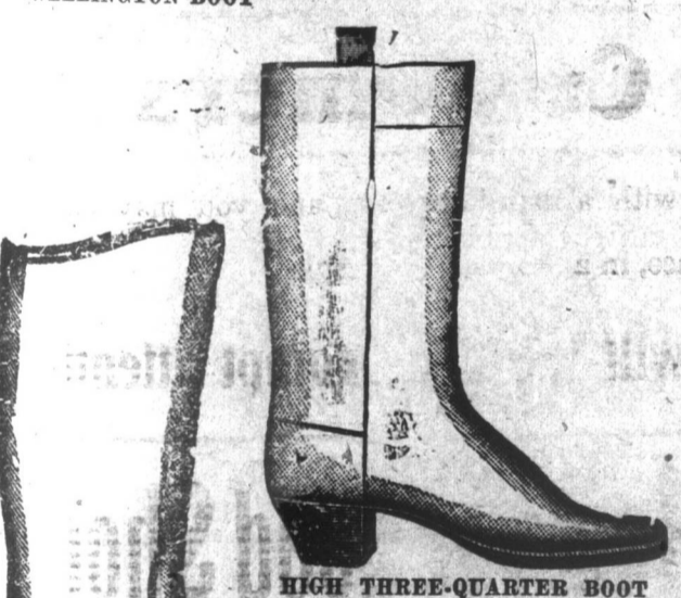
HIGH THREE-QUARTER BOOT