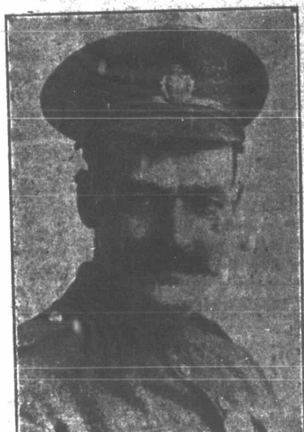
To Electors of the County of Carleton;

50c. a box, 6 for $2.50, trial size 25c. At all dealers or sent postpaid by Fruit-a-tives Limited, Ottawa.