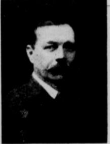
Sir A. Conan Doyle