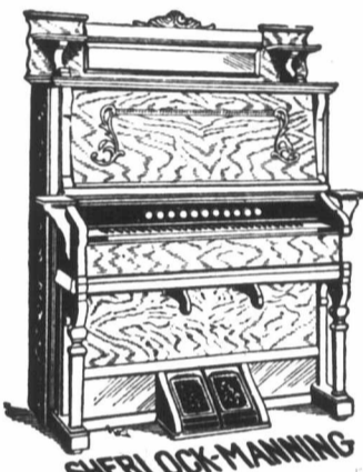
Bargain No. 6.

The organs we have selected for this special offer are the best representative instruments by makers who individually possess a reputation for tonal excellence and durability that is unquestioned, and as we ship subject to approval, and will pay the return freight on any organ not entirely satisfactory, customers living at a distance can buy just as safely through our Mail Order Department as those who have the opportunity of visiting our warehouses and making personal selection. Below we give complete description of the instruments. Should you wish any further information, write us. Our Mail Order Department is at your service for the asking.