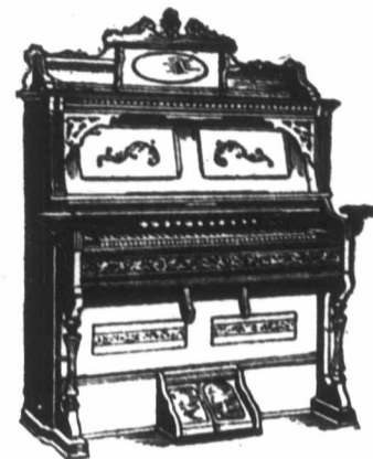
Bargain No. 5.

Our recent advertisement of used organs having elicited many enquiries for prices of new instruments, we placed extra large orders with the manufacturers, in order if possible to effect a still further saving in price, and now offer buyers a choice of seven new organs at almost wholesale prices.