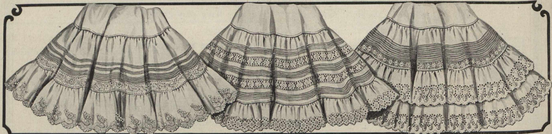
R1-2908. Women's Skirt , made of soft nainsook, French band, 9½-inch umbrella flounce of fine lawn trimmed with one cluster of five narrow tucks, and two clusters of three tucks, flounce is headed above with one row Swiss insertion 2¼ inches wide, 8-inch flounce of extra fine embroidery to match, under dust ruffle, well made and finished. Lengths 38, 40 and 42 inches..... 2.25