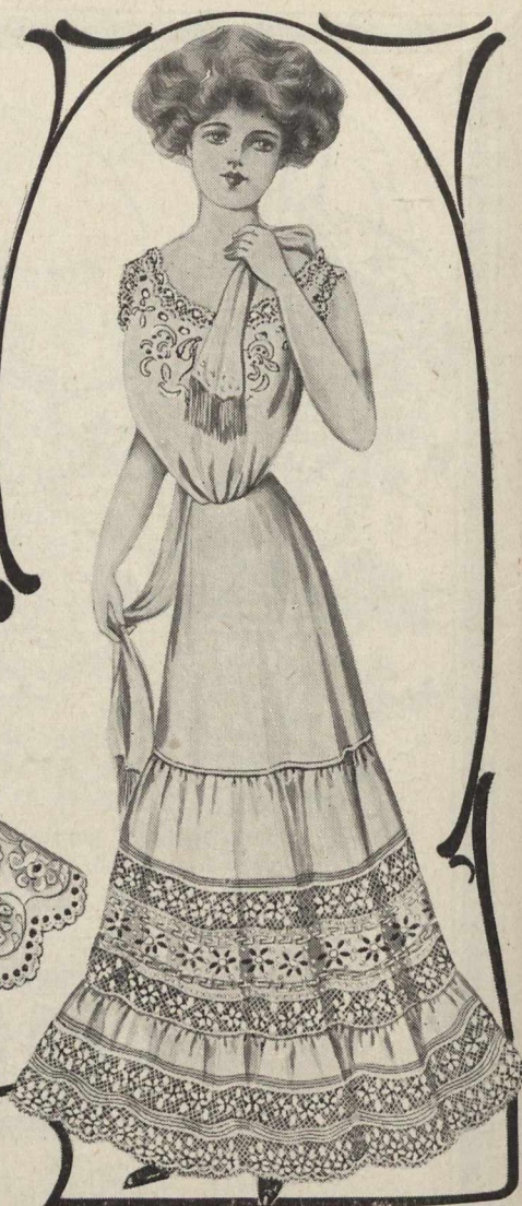
R1-2909. Women's Skirt made of fine soft nainsook, French band, deep umbrella flounce trimmed with three clusters of narrow tucks, three rows of handsome lace insertion 2 inches wide, one row extra fine embroidery, insertion 4 inches wide, finished with 2½-inch ruffle of lace, under dust ruffle, well made and finished. Lengths 38, 40 and 42 inches..... 2.75