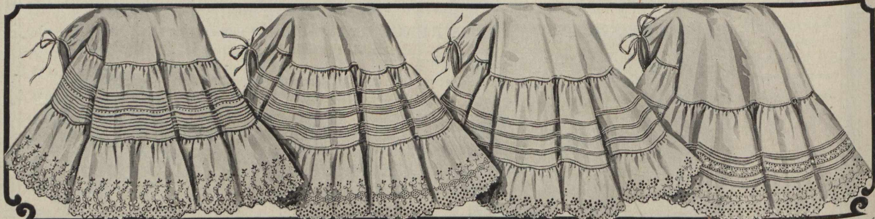
R1-2904. Women's Skirt , made of soft finished cotton, French band, has 9-inch umbrella flounce of fine lawn trimmed with two clusters of five narrow tucks and 1½-inch hemstitched tuck, finished below with 11-inch flounce of extra fine quality embroidery, well made and finished. Lengths 38, 40 and 42 inches.... 1.25