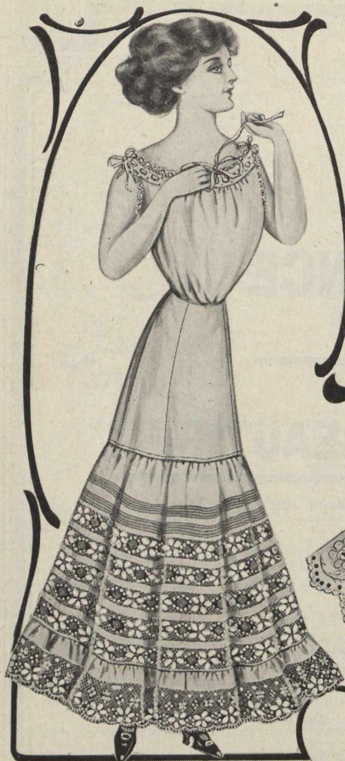
R1-2907. Women's Skirt , made of fine cotton, French band, deep umbrella flounce of fine lawn trimmed with two clusters of five hair tucks, five rows lace insertion 1½ inches wide, finished below with 2½-inch ruffle of fine lawn and 4-inch ruffle of lace. This makes a very pretty skirt, neat pattern, durable quality, lengths 38, 40 and 42 inches..... 2.00

Acme Brand, which is of our own manufacture, has never been more beautiful and dainty than now. Never before has fashion conceived such charming creations as we are offering for Spring and Summer wear. Those women who are gowned in the latest modes—those who are gowned most conservatively—are they who depend upon Acme whitewear to impart the last touch of completeness to their costumes. Our skirts for 1910 are art triumphs. They are the very pinnacle of whitewear fashion, offering the last word in fancy designs, now in vogue in New York, London and Paris.