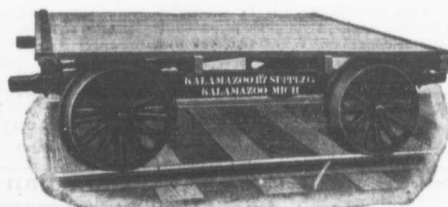
Push Cars and Rail Cars