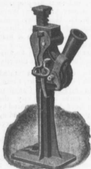
Norton Track Jacks