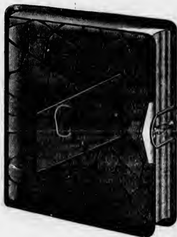
STYLE NO. 2

THE BEST. THE CHEAPEST. THE MOST POPULAR.