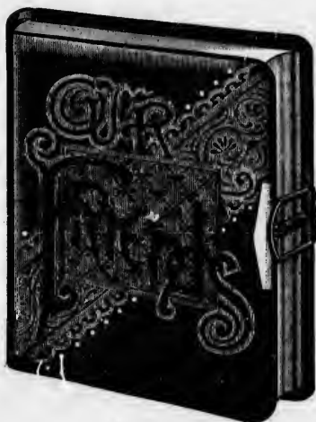
STYLE NO. 1