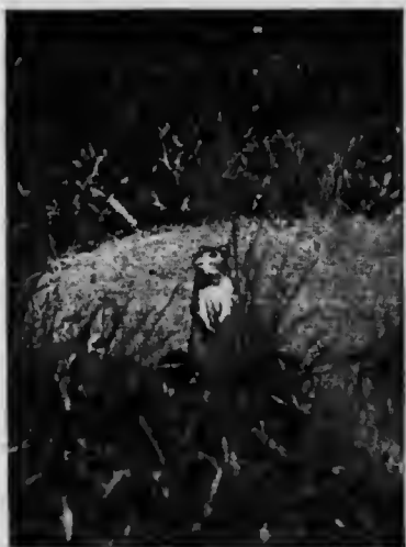
Characteristic attitude of the gopher.