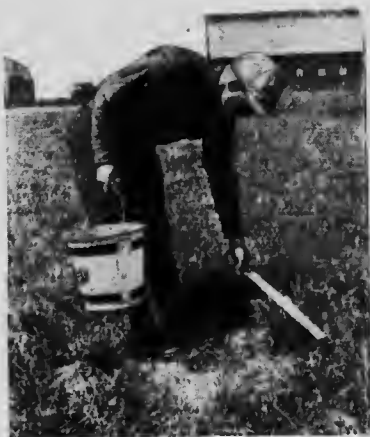
Placing poison in the gopher holes.