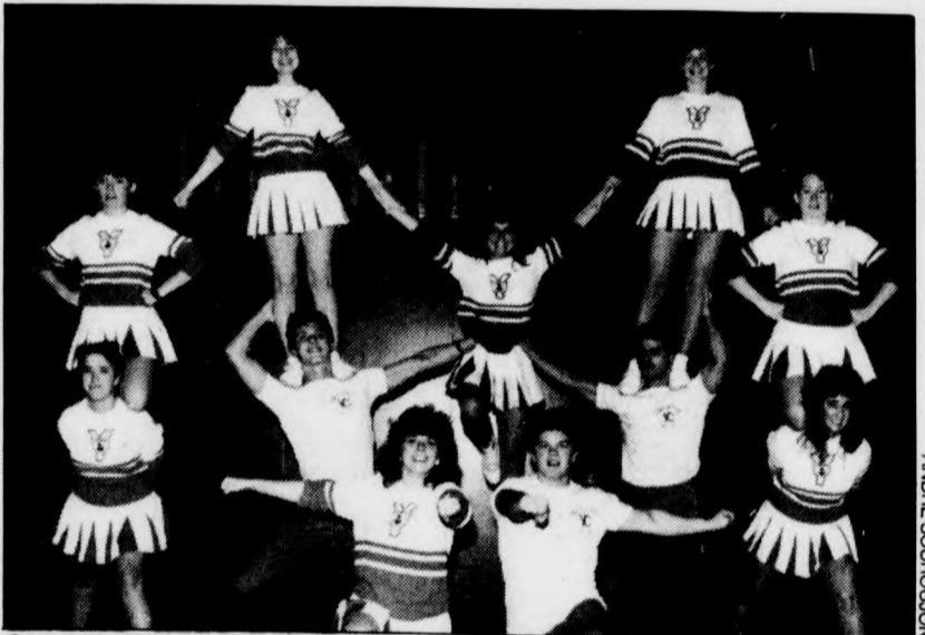
QUICK, TAKE THE PICTURE BEFORE THEY FALL: York's cheerleader's continue to practice their routines. The cheerleaders can be seen at some Yeoman games, but no Yeowoman games.