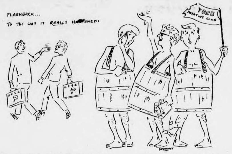
"SURE ... I KNOW WE WERE OBLICED TO BE GOOD HOSTS ... BUT $7000 WORTH OF YORKA??