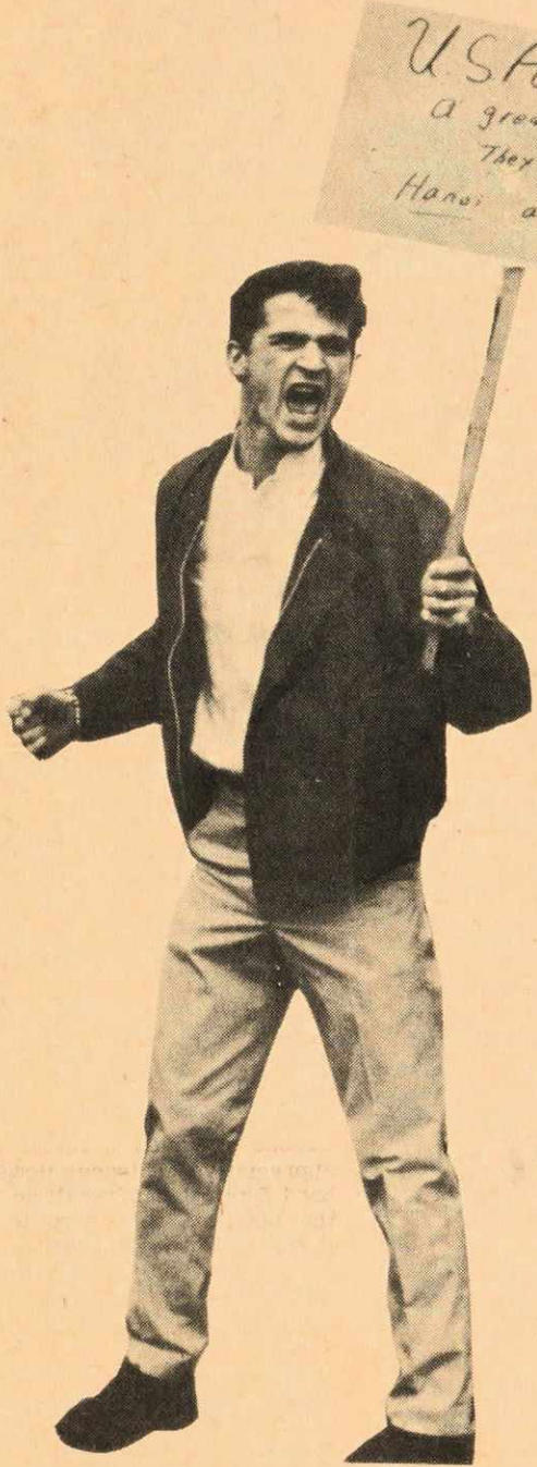
Intellectual Elite also present