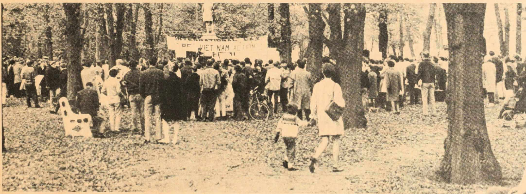
Over 600 hear Viet speeches