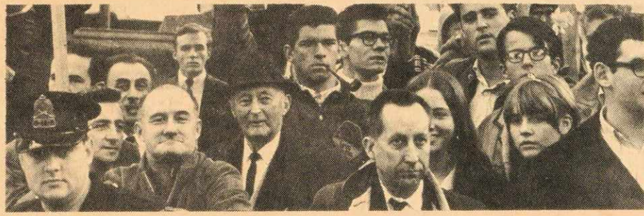
Some of 300 onlookers