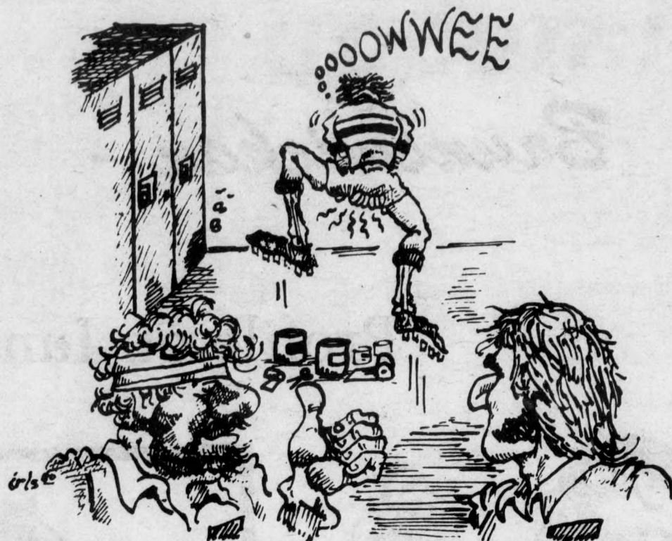
"MIXED UP THE LINAMENT AND LUBRICANT JARS AGAIN."