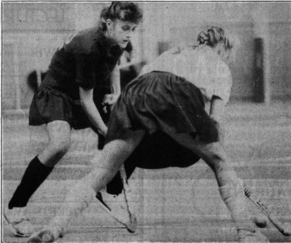
UBC and UVic battle in the Butterdome. The Panda field hockey team finished fourth in the five team tourney.