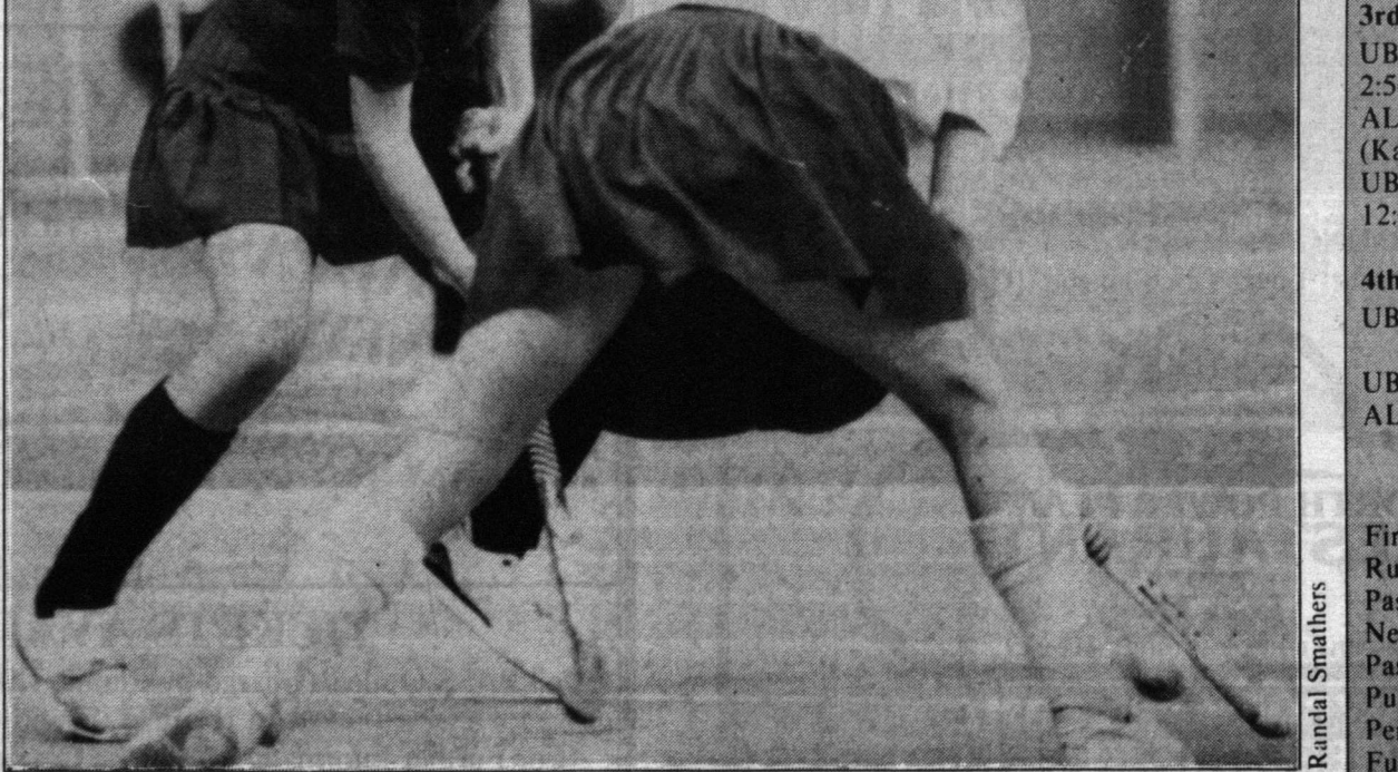
UBC and UVic battle in the Butterdome. The Panda field hockey team finished fourth in the five team tourney.

If that was the attitude of Bear fans, there would have been more media than fans out on Saturday. The fact that 600 people showed up for an ohand-whatever team says a lot. and all of it good. Take a bow, folks.