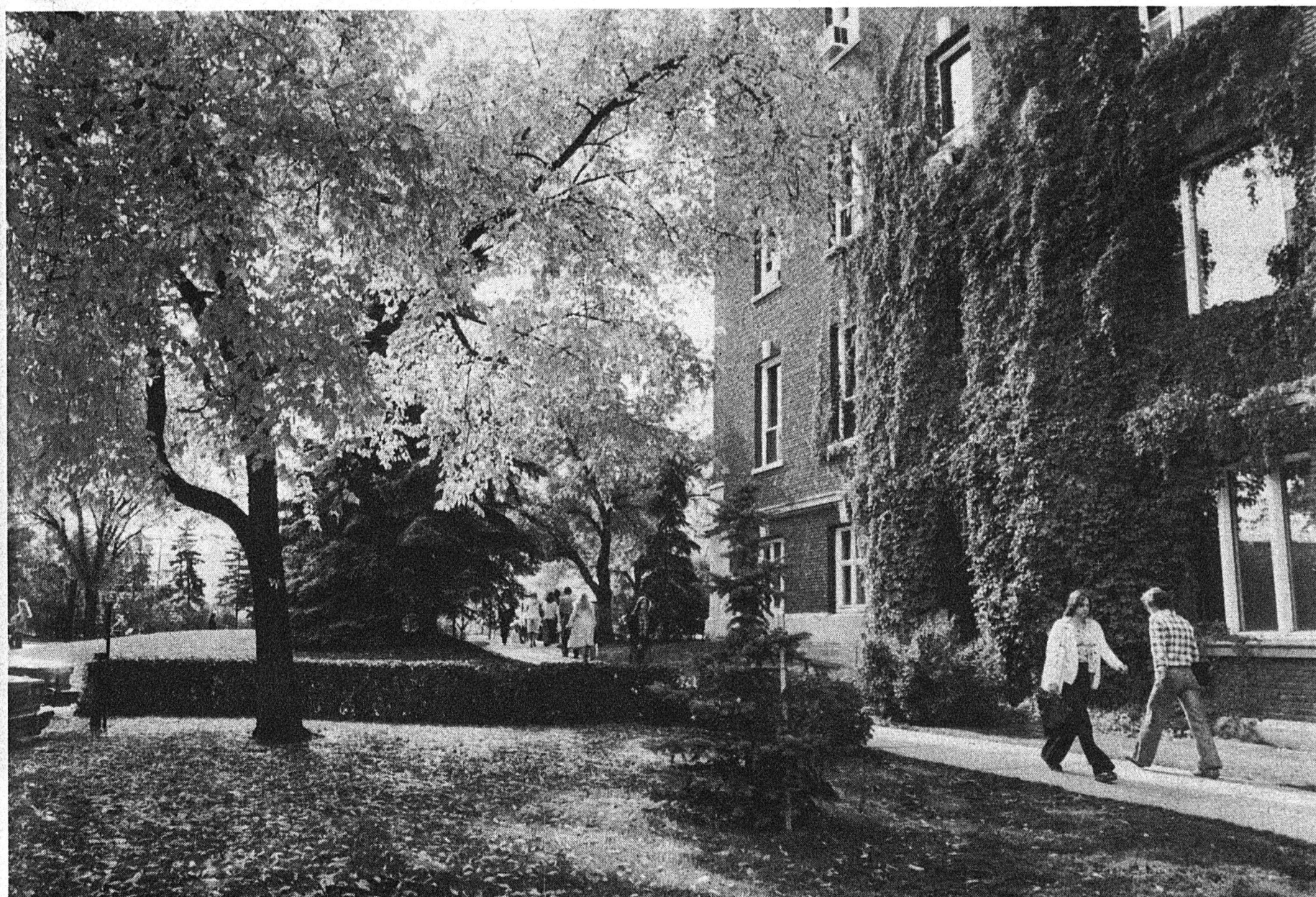
Those were the days. Green grass, colorful leaves and final exams seven months away.