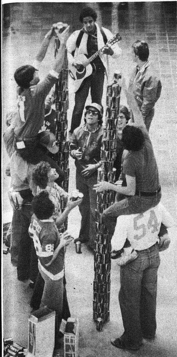
Can stacking in CAB. This is the highest anyone has got on coca-cola since they took out the tincture of cocaine.