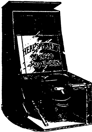
Inodorous Portable Bedroom Commode

- A Special Silver Medal Awarded at Toronto, 1885 -