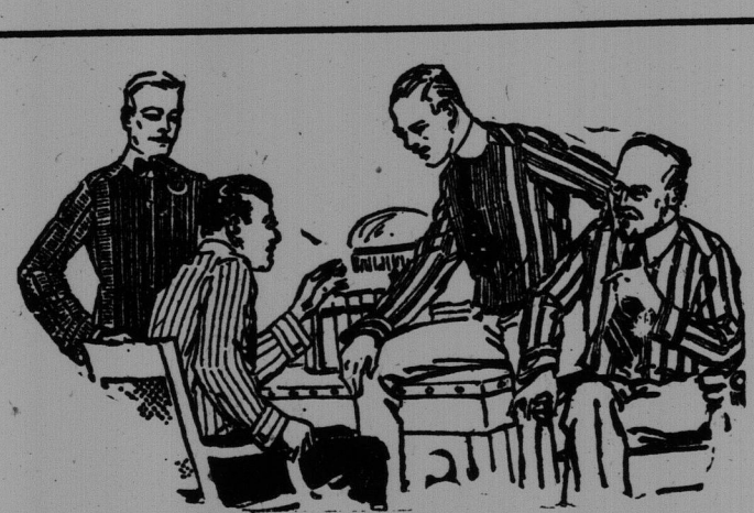
Shirts-3 Big Feature Values

Everything in Men's Haberdashery at Sale Prices Also Big Specials in TRUNKS and BAGS.