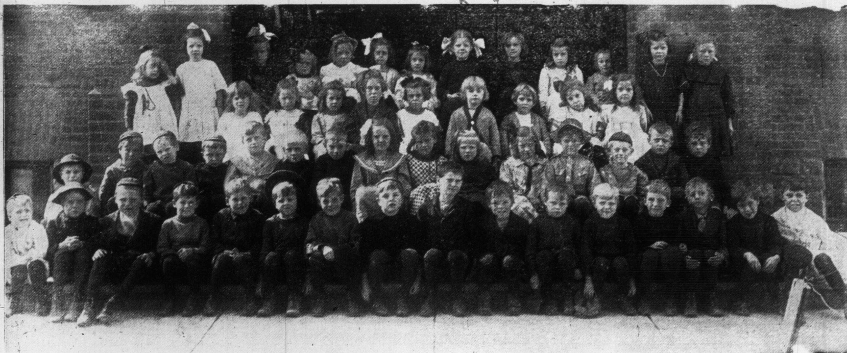
WESTON PUBLIC SCHOOL—THE PRIMARY CLASS. PHOTOGRAPHED FOR THE SUNDAY WORLD.