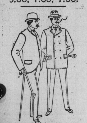
Men's Spring Suits with your whiskey. In Tweeds and Serges Healthful, durable, attractive. Send for catalogue. Tisdale Iron Stable Fit-tings Company, Limited, 6 Adelaide-street east, Toronto. 136

4.50, 5.00, 6.00, 7.00, 8.00, 9.00 10.00 and