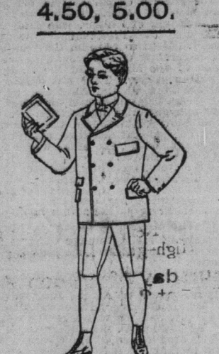
Boys' Double-Breasted Three Piece Suits For Ages 10 to 15 3.50, 4.00, 4.50, 5.00, 6.00, 6.50, 7.00.