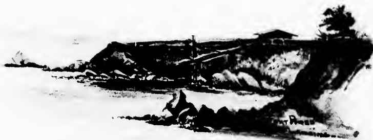
LANDING AT FORT ROSS, CALIFORNIA