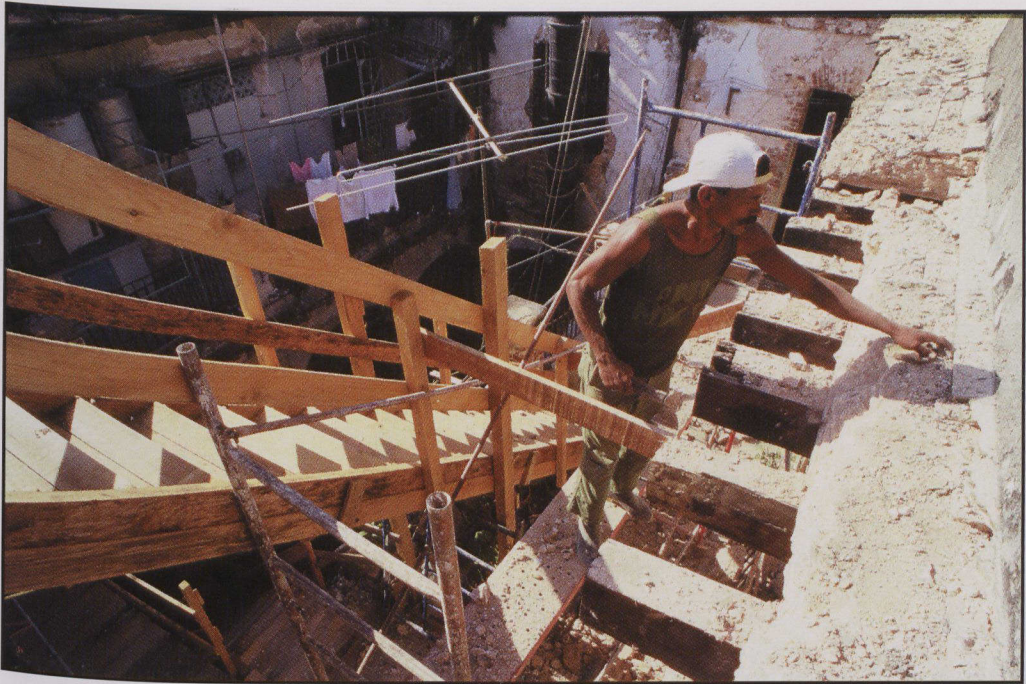
Reconstruction of Calle Teniente Rey, No.113, in Old Havana, 2003

A new project with the Office of the Historian is now underway across the street at Teniente Rey No.113. This project will provide for the renovation of the facade, internal staircases, and electrical and plumbing systems of an 1860s era hotel, which was divided into separate small apartments currently housing 33 families.