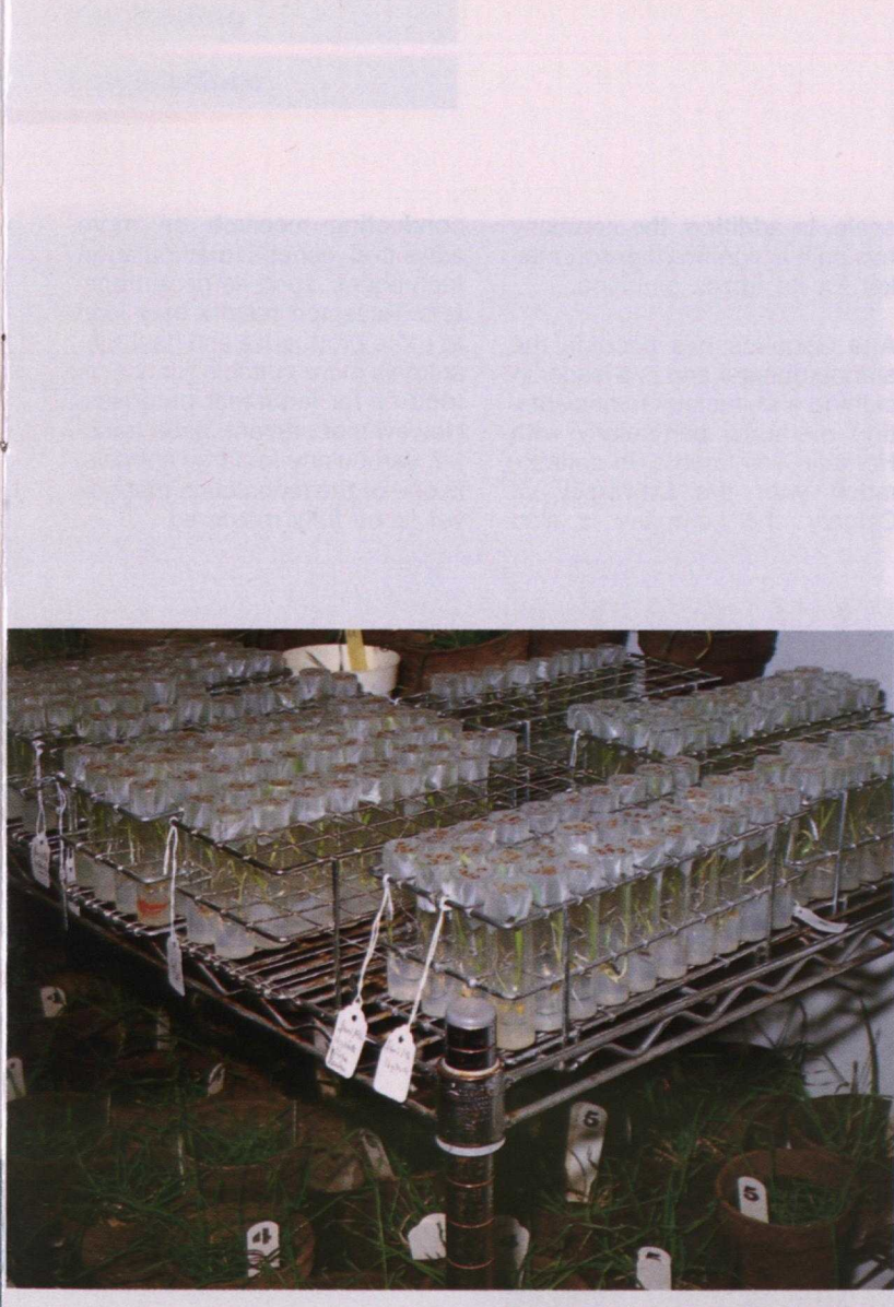
Barley embryos cultivated in a nutritional medium — viable plantules. (W.G. Thompson & Sons Ltd.)

male sterile and resistant to triazine, a herbicide that is normally toxic to colza.