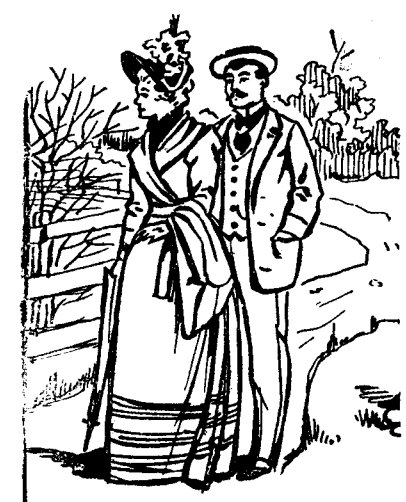
YOU'LL BE SNUBRED.

Lawyer: "Were you acquainted with the deceased?" Witness: "Only in a the deceased?" Witness: "Only in a large way. I was clerk in a large business wav. store at which the lady did much of her shopping." Lawyer: "Did you in that capacity notice in her any signs of insanity?" Witness: "Well no Witness: "Well, no, not insanity exactly-merely eccentricity. I was in the thread department and I have frequently seen her buy a spool of thread and carry it home herself."