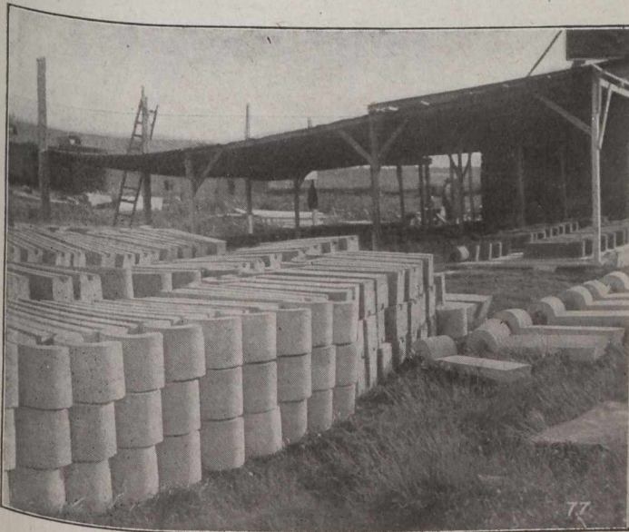
Fig. 1.—Blocks Ready for Use.

Admitting, then, the value of appearances, it remains for us to consider the question of means; and when these