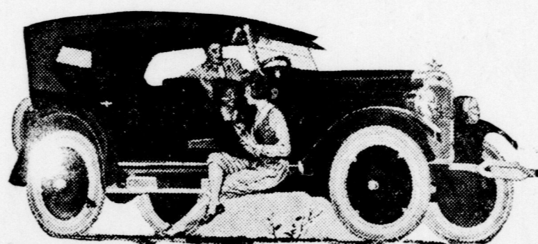
Five-Passenger "Red Bird" Overland Sport Model Touring Car.

The winner of this prize will have his or her choice of either car or $1,000 in cash.