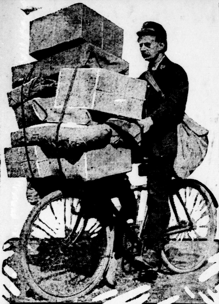
A PROVINCIAL postman in England starts the day with hands and handle-bars full. Dollar Day brings Western Ontario residents advantages that have not yet been demonstrated in Old London Town.