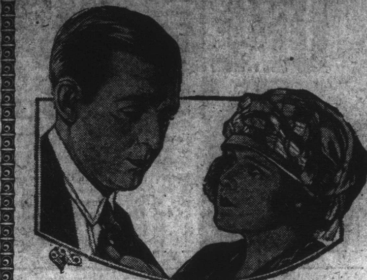
Wallace Reid and Wanda Hawley in a scene from the Paramount Picture "THIRTY DAYS."

THE NEW FRENCH REMEDY. THERAPION No. 1 THERAPION No. 2 THERAPION No. 3 No. 1 for Rheumatism, No. 2 for Chronic Weakness, No. 3 for Kidney Disease. Price in U.S. $1.00 per bottle. Sold by all druggists. Do not let the cheap imitations fool you. The only genuine is the one with the red and white label. Do not let the cheap imitations fool you. The only genuine is the one with the red and white label.