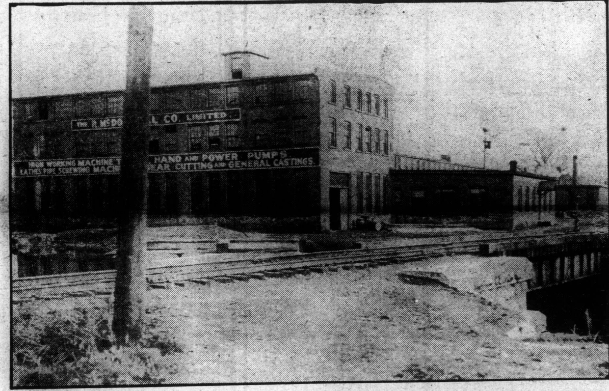
The McDougall Company, Limited, Galt, a concern employing 250 hands, whose building the Lake Erie & Northern Railway Company have purchased and will tear down as part of the terminal and railway yards