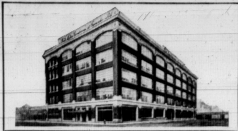
Toronto Branch Area 133,000 sq. ft. Cost $328,000