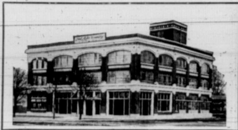
London, Ont. Branch Area 49,872 sq. ft. Cost $161,000