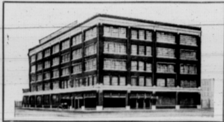
Winnipeg Branch Area 123,000 sq. ft. Cost $250,000