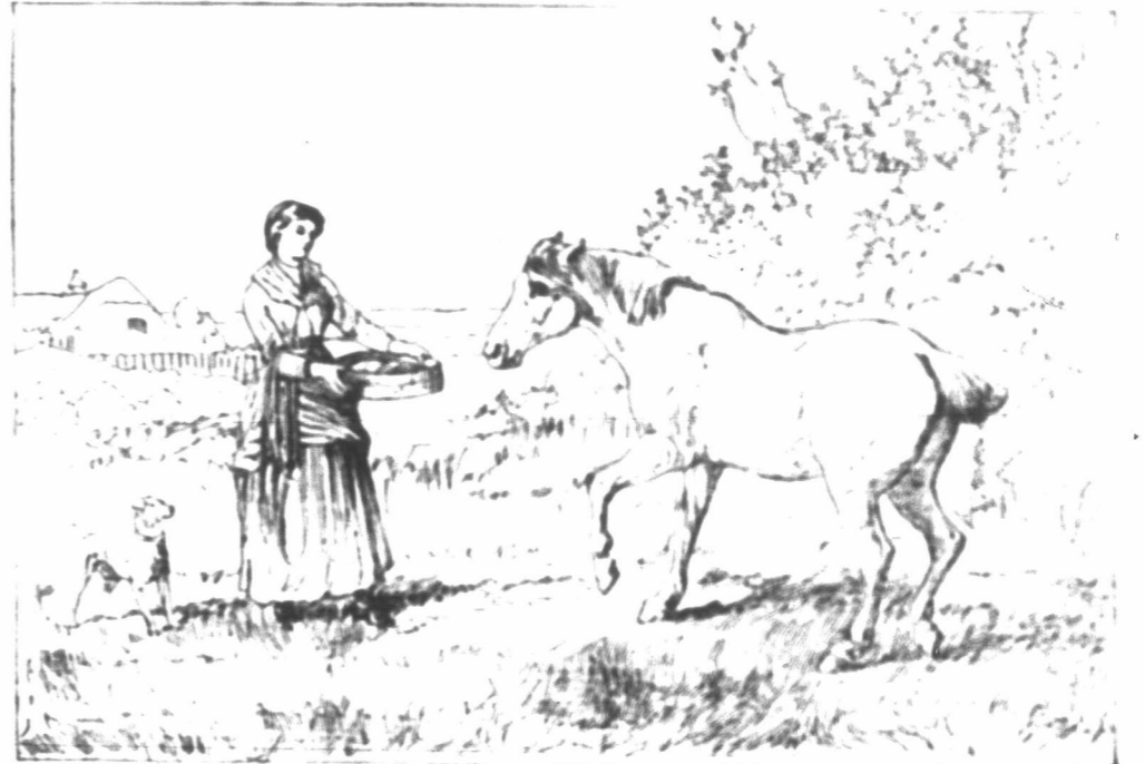
"NOT TO BE CAUGHT WITH CHAFF."—Size 28 x 22 inches.

One year to any address and the choice of either picture, post paid. This offer is extended to all our subscribers, renewals as well as new names. Subscribers whose subscriptions have not expired, or those recently renewed, are privileged to accept this great offer, in which case their term of subscription will be extended one year.