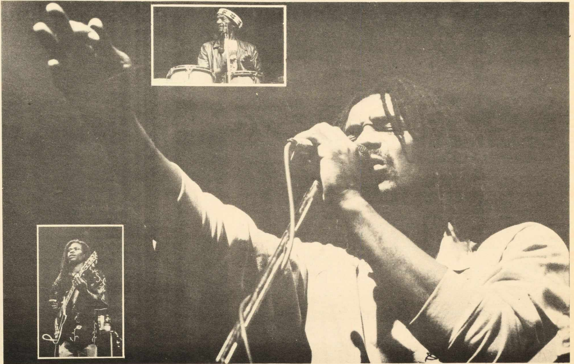
Trunks swayed to the reggae rhythm