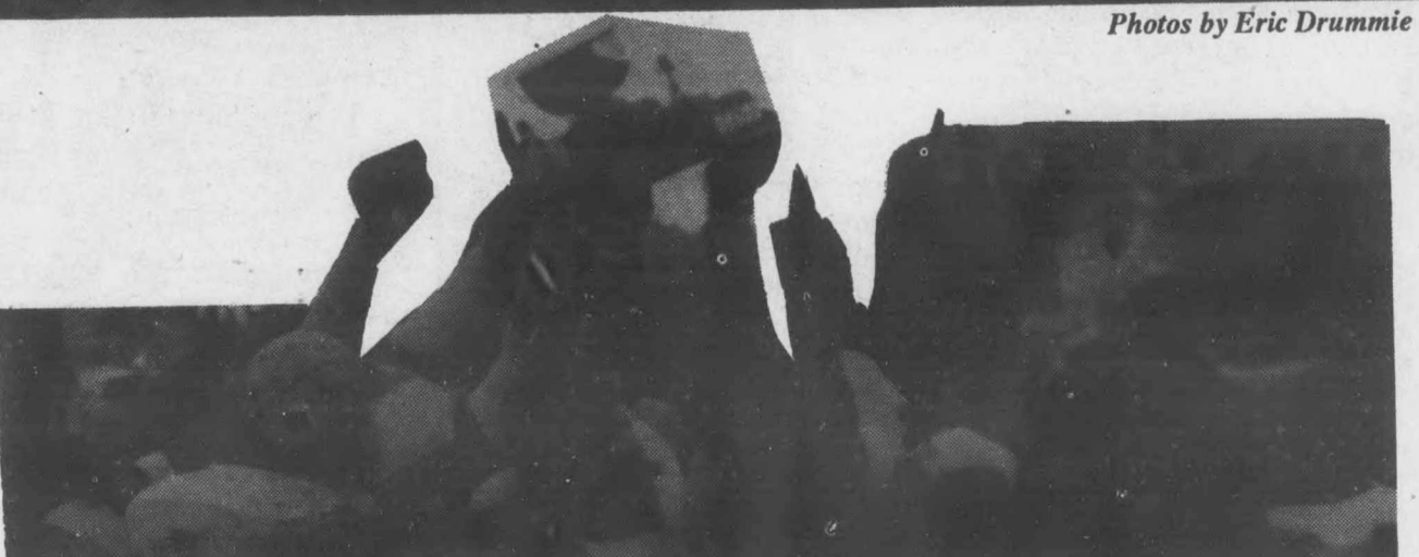
The Huskies celebrate their victory

St. Mary's will be playing the Calgary Dinosaurs, who were 34-15 winners over the Western Ontario Mustangs in the Central Bowl.